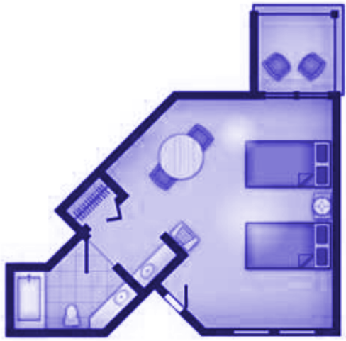
Studio Vacation Home