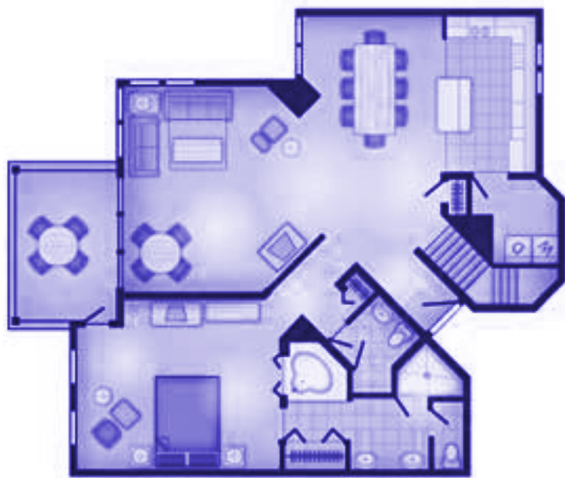
3 Bedroom Grand Villa 1 st Floor